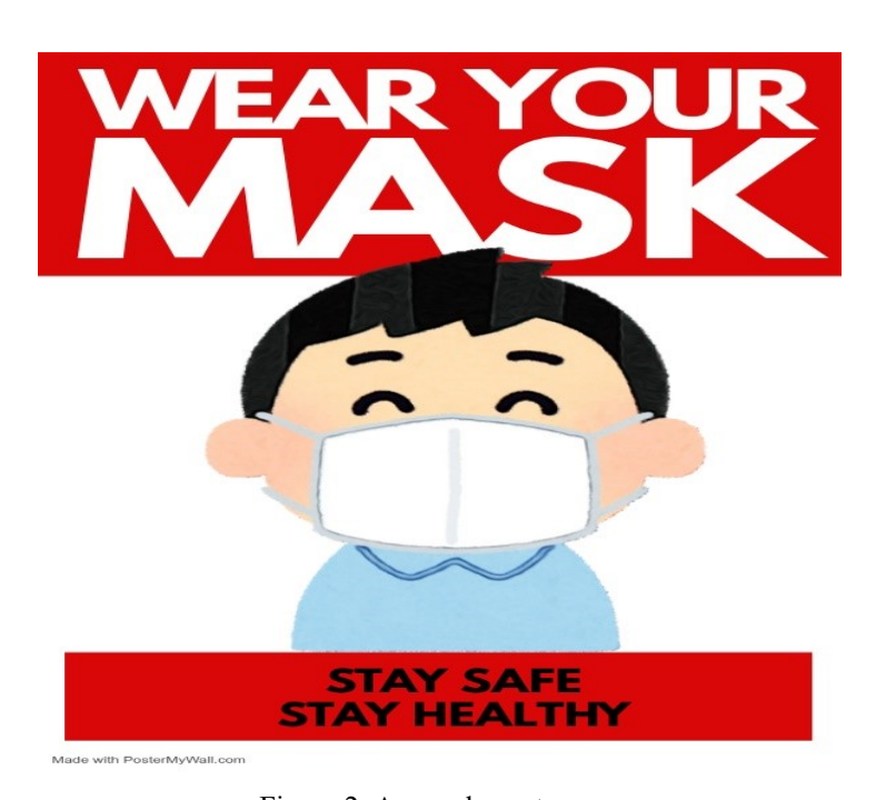
Figure 2. A sample poster

You need to wear your mask whenever you leave your house. The mask must cover your nose and mouth so that it can protect you from the COVID-19 virus, especially when you are in a public place and meet a lot of people. Always remember to wear your mask, stay healthy, and stay safe!